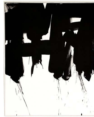
▲ BLACK & WHITE ABSTRACT SERIES #71