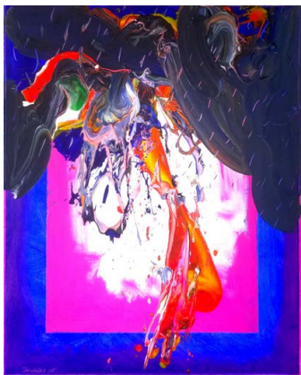
▲ STORM SERIES #5