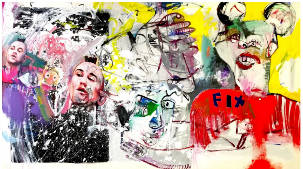
"Taxi Driver" 2018, acrylic on canvas, 152.4 x 274.3 cm