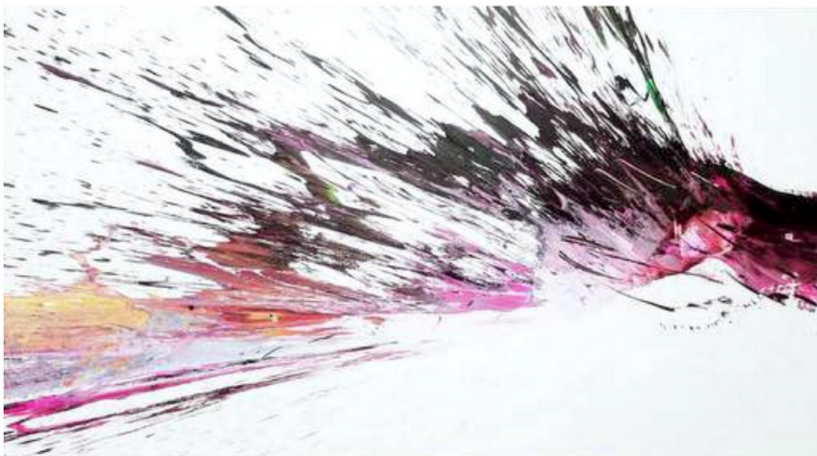
"Splash of Colour II #124" 2018, acrylic on canvas, 152.4 x 274.4 cm, ph credit and courtesy of the artist