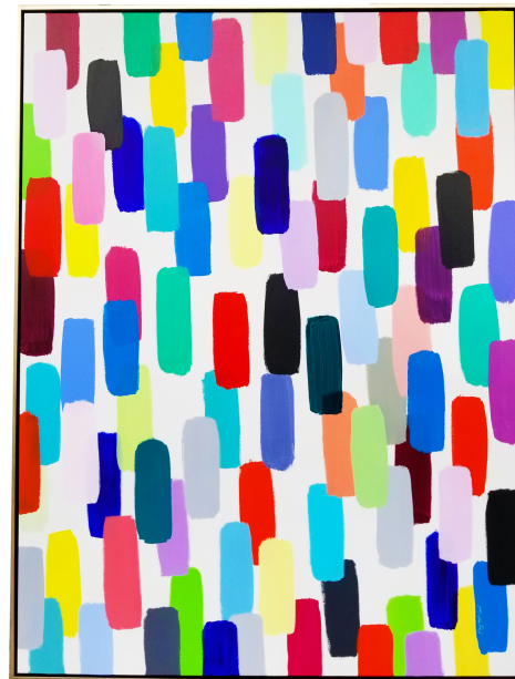
Jelly Bean #38, 2017, acrylic on canvas, 72" x 54"