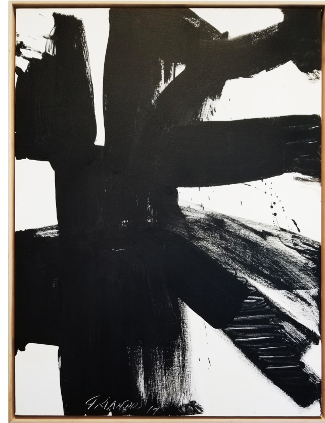
Black and White #3, 2017, acrylic on canvas, 40" x 30"

His other love: four kittens that were found in a garage on the verge of death. He takes me to see them and four pairs of tiny eyes are staring at me. As soon as he opens the little gate, they start jumping around and climbing the sculptures. "Is it okay that they climb these art pieces?" "Absolutely. I love them, they can do as they please. You can tell how amazing people are by how happy their animals are."