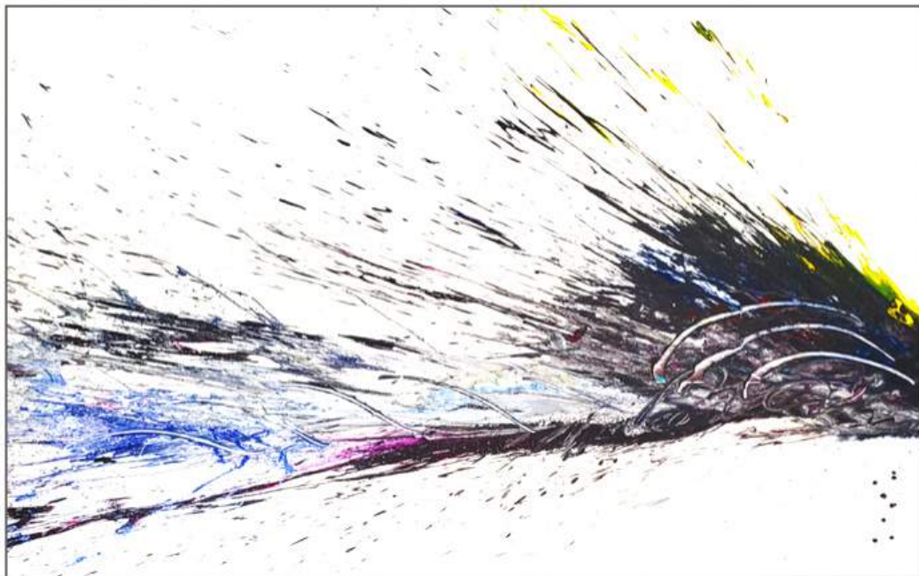
Splash of Colour 2 #167, 2019, acrylic on canvas, 60" x 96"

The artist decided to gift his piece after a breathtaking masterclass he gave to their wonderful students. He taught them how to create an abstract work of art using not only paintbrushes and oils but also energy, inspiration, and love.