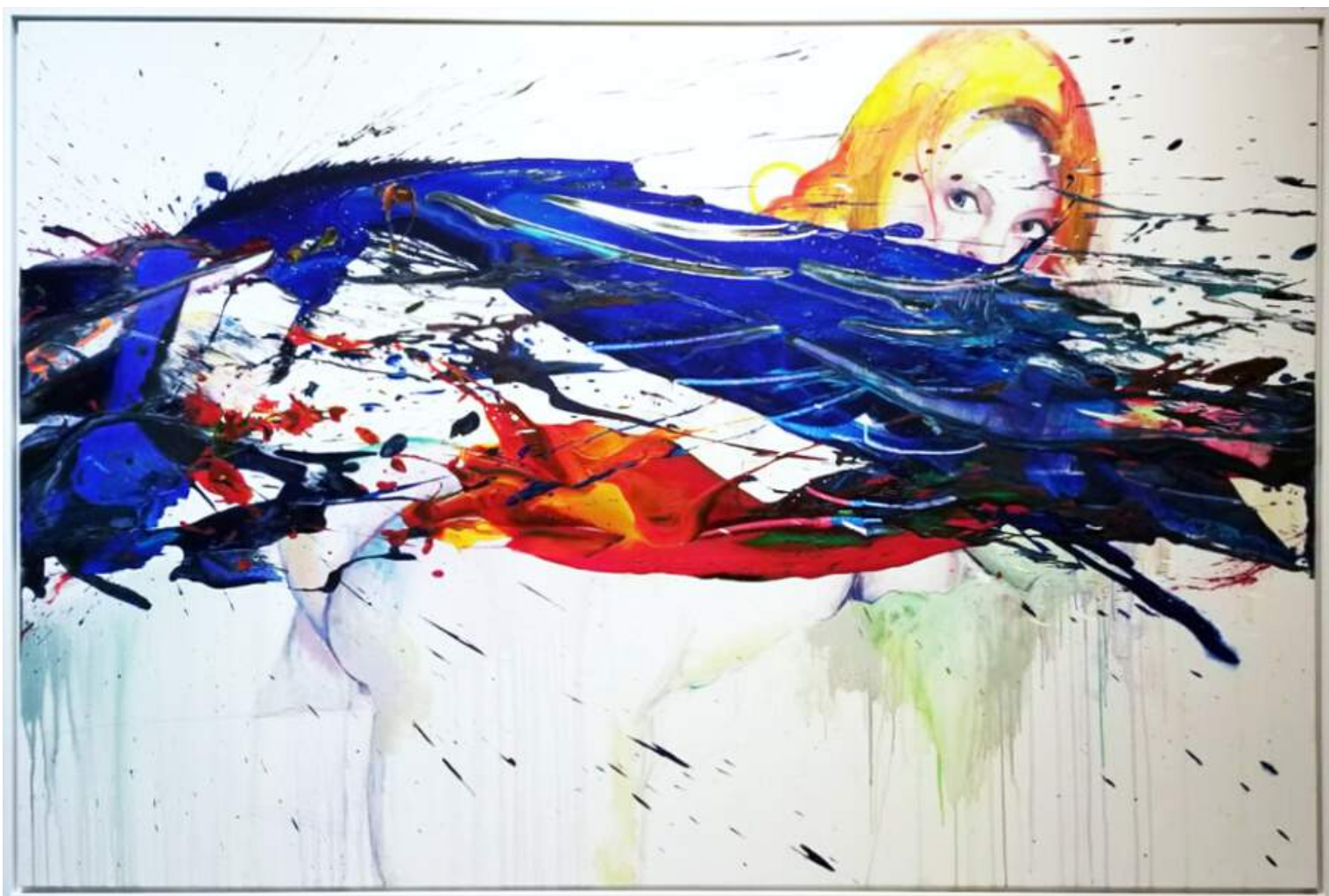
Splash of Colour 2 #166, 2019 acrylic on canvas, 48" x 72" (122 x 183 cm)