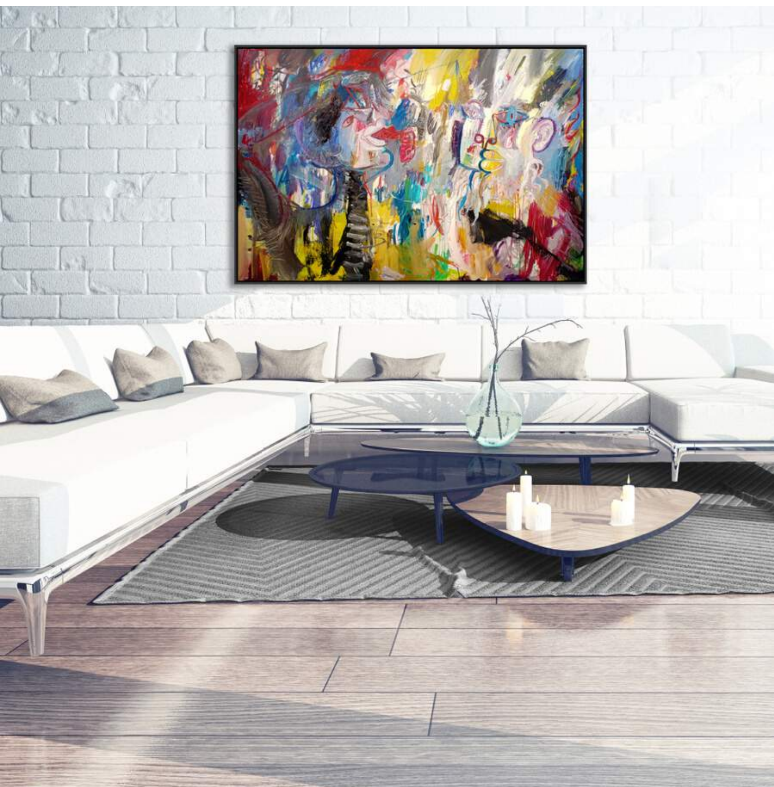
The Philosopher, 2019 acrylic on canvas, 48" x 72" (122 x 183 cm)