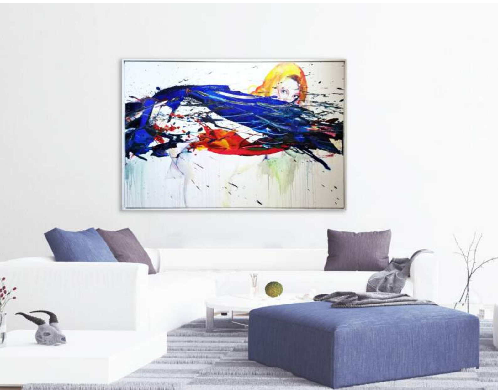
Splash of Colour 2 #166, 2019 acrylic on canvas, 48" x 72" (122 x 183 cm)