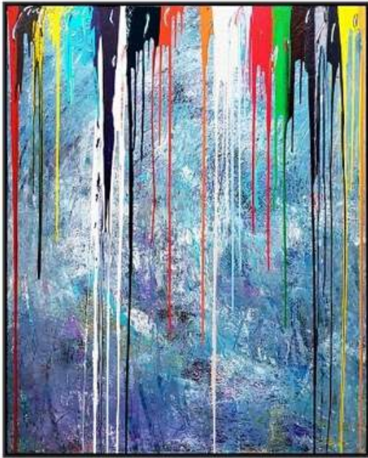
Splash of Colour #29, 2019 acrylic on canvas, 60" x 48"