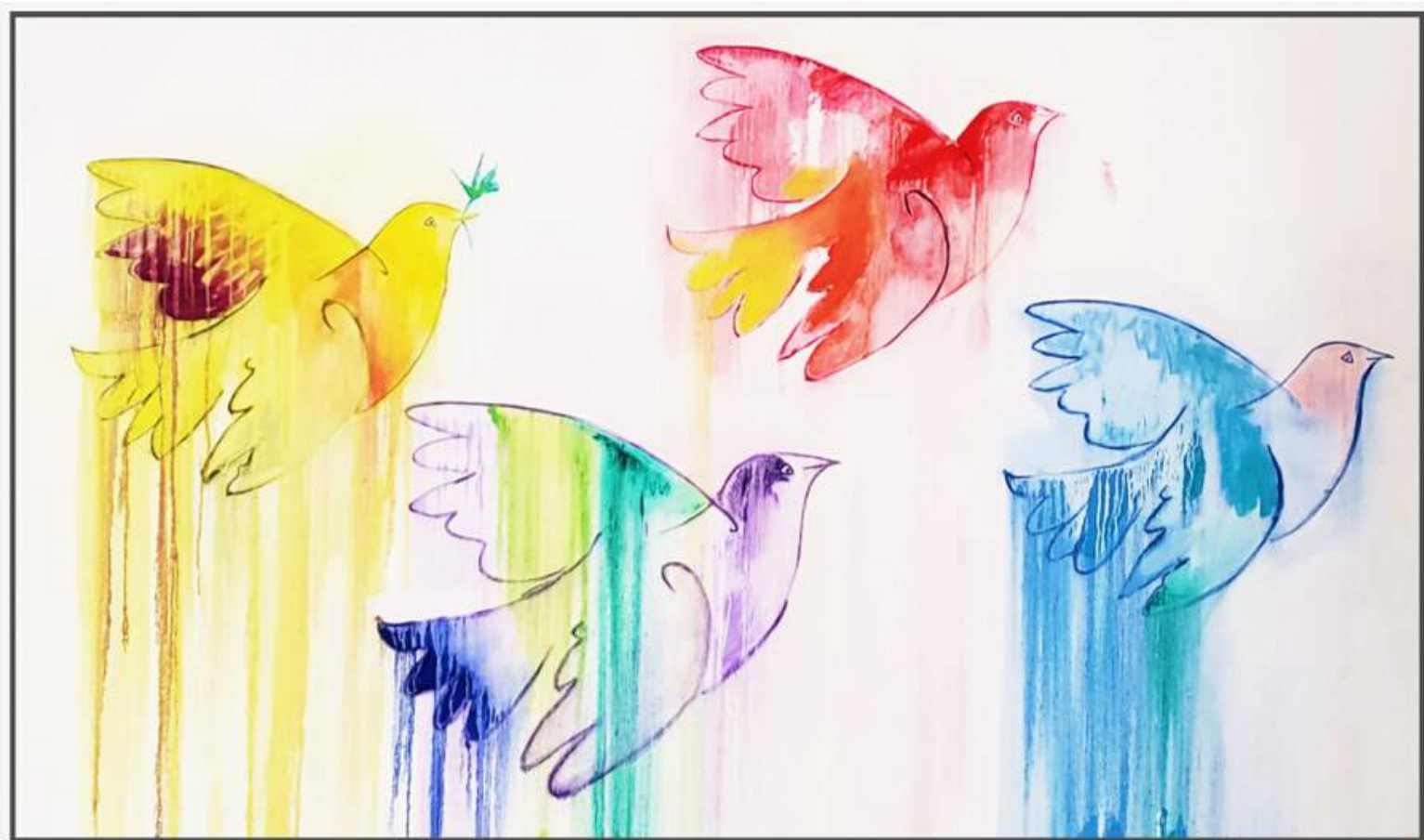
Peace and Freedom, 2019 oil on canvas, 36" x 60" (91.4 x 152 cm)