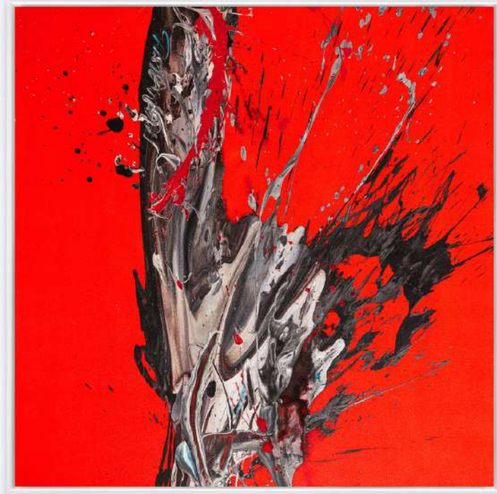
SP 2 #86, 2018 acrylic on canvas 48" x 48" (122 x 122 cm)