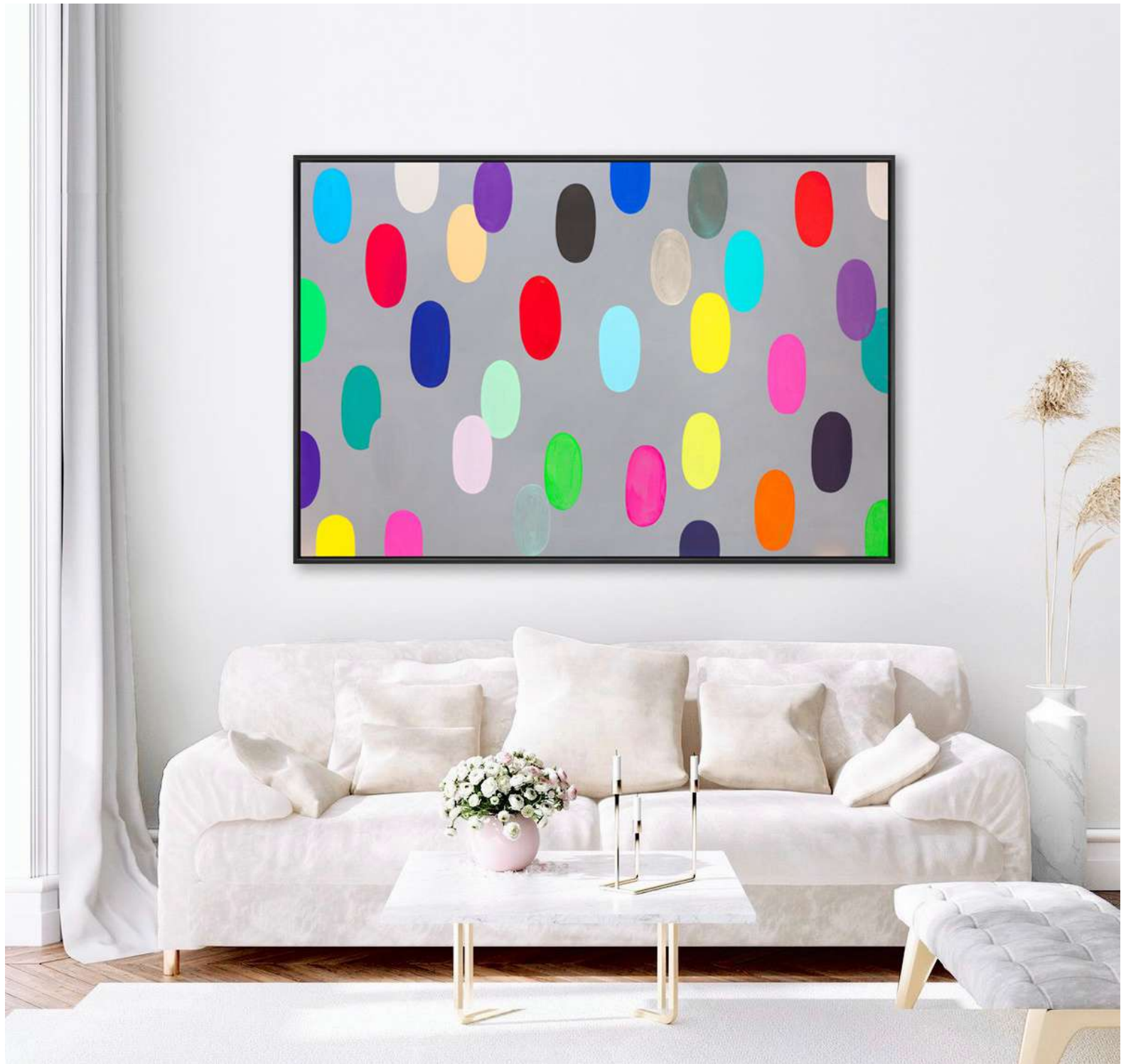
Jelly Bean #93, 2022 acrylic on canvas 48" x 72" (122 x 183 cm)