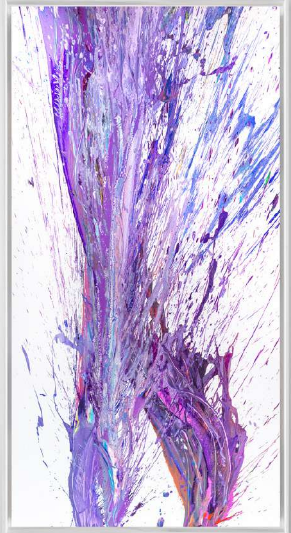
SP 2 #114, 2022 acrylic on canvas 72" x 36" (183 x 91.4 cm)