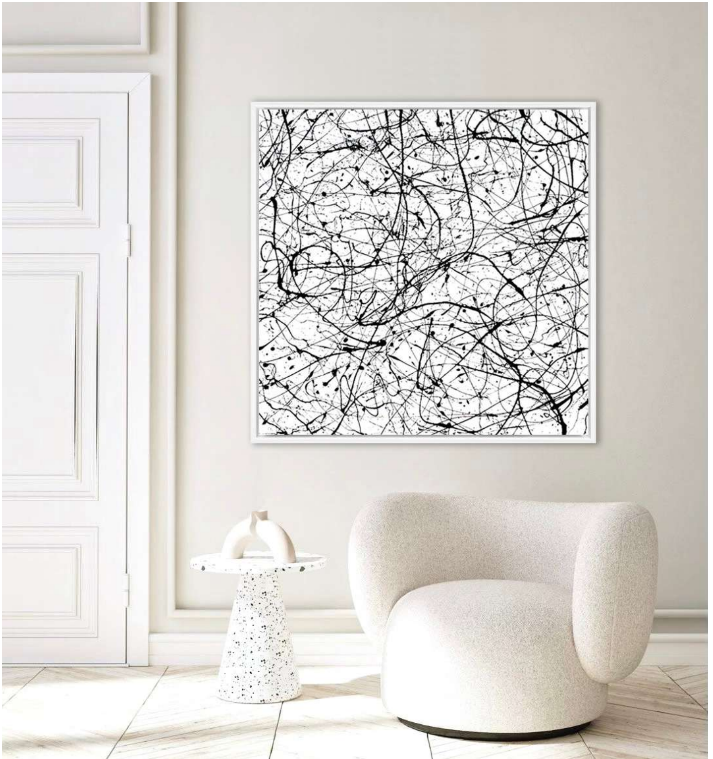
Winter Paradise #26, 2019 acrylic on canvas 48" × 48" (122 x 122 cm)