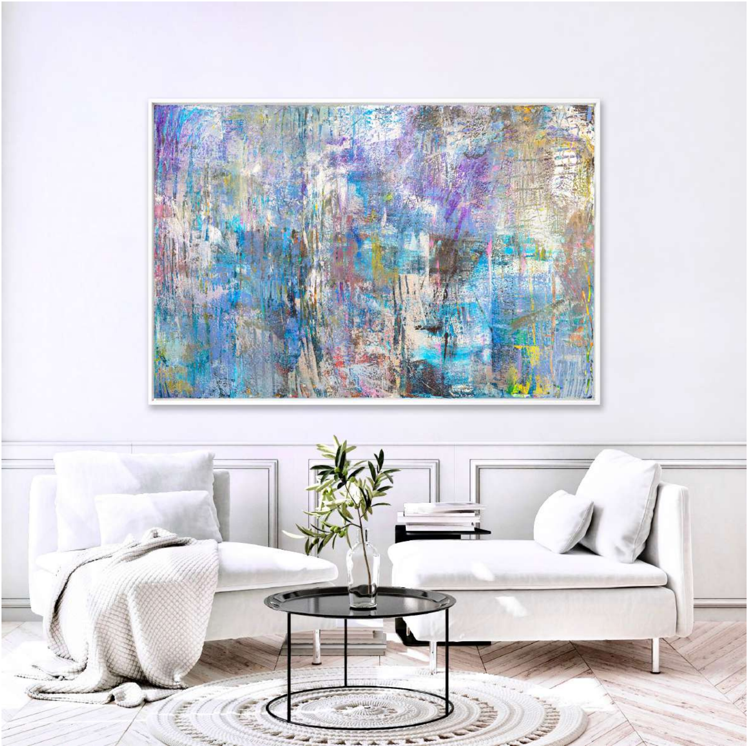
Untitled #1, 2022 acrylic on canvas 48" x 72" (122 x 183 cm)