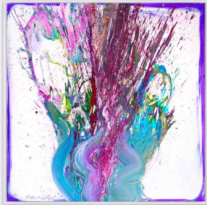
SP 2 #177, 2022 acrylic on canvas 48" x 48" (122 x 122 cm)