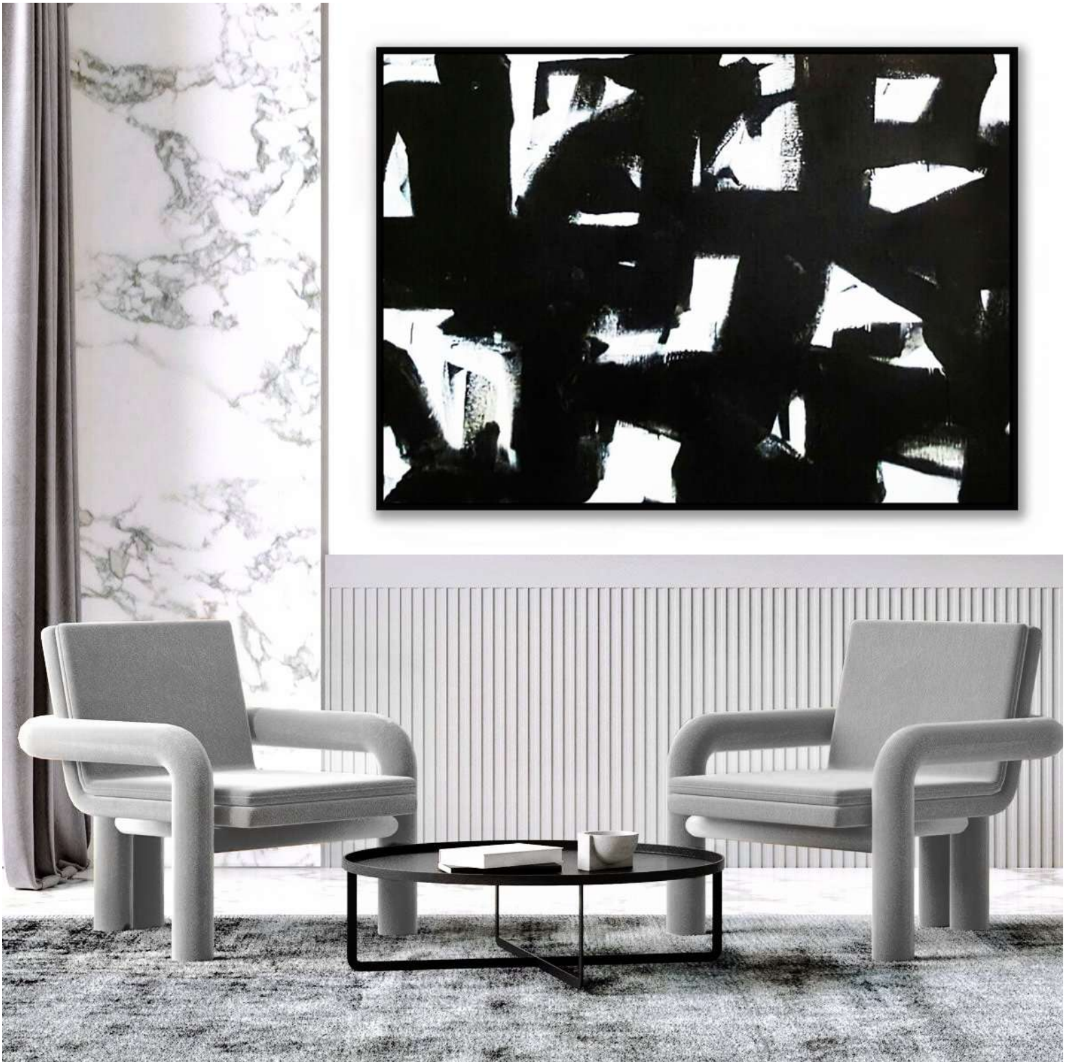
Black & White #38, 2016 enamel on canvas 44" x 62" (112 x 157.5 cm)