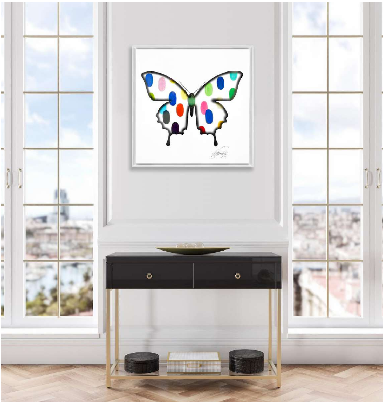
Butterfly Jelly Bean #3, 2022 mixed media on canvas 24" x 24" (61 x 61 cm)