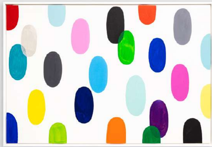
Jelly Bean #90, 2022 acrylic on canvas 35" x 52" (89 x 132 cm)