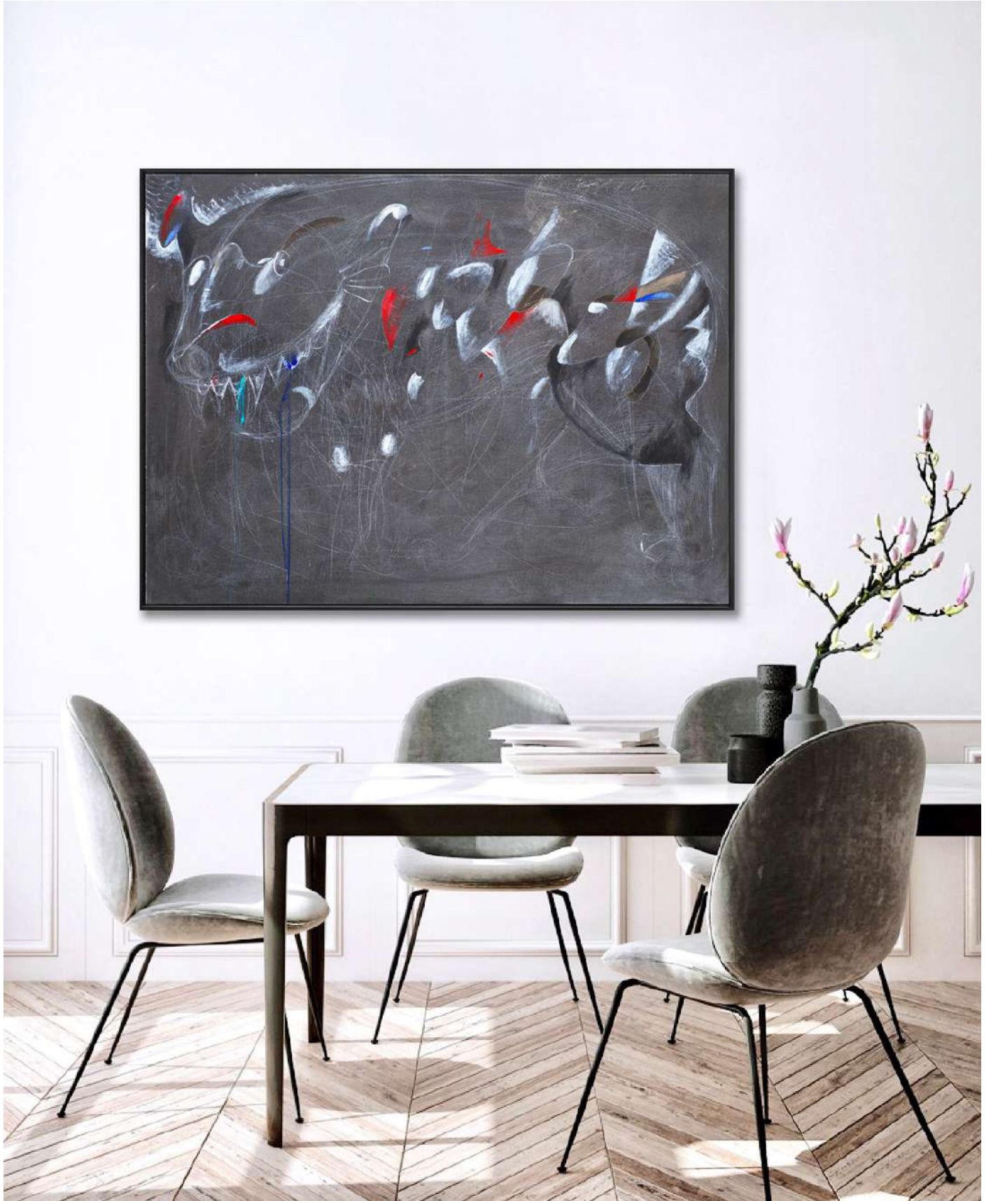
Untitled #17, 2022 acrylic on canvas 30" x 40" ( 76.2 x 101.6 cm)