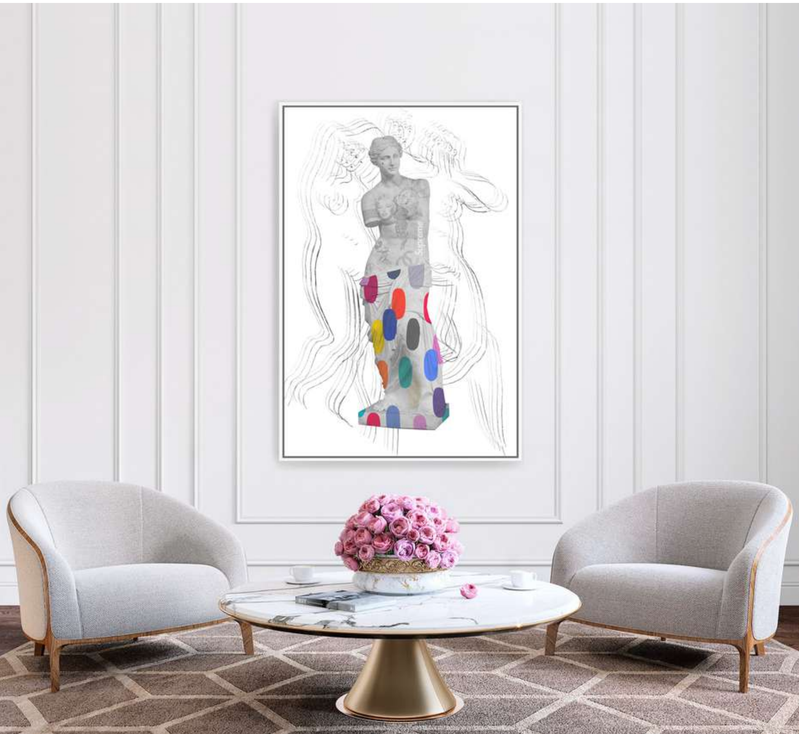
Aphrodite Jelly Bean #12, 2022 mixed media on canvas 48" x 36" (122 x 91.4 cm)