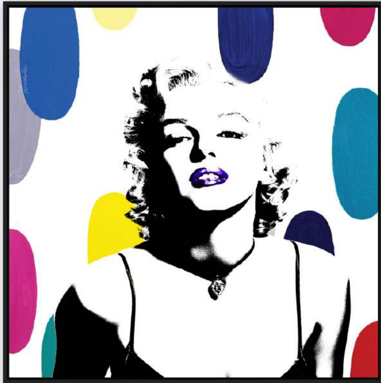
Marilyn Jelly Bean #4, 2022 mixed media on canvas 48" x 48" (122 x 122 cm)