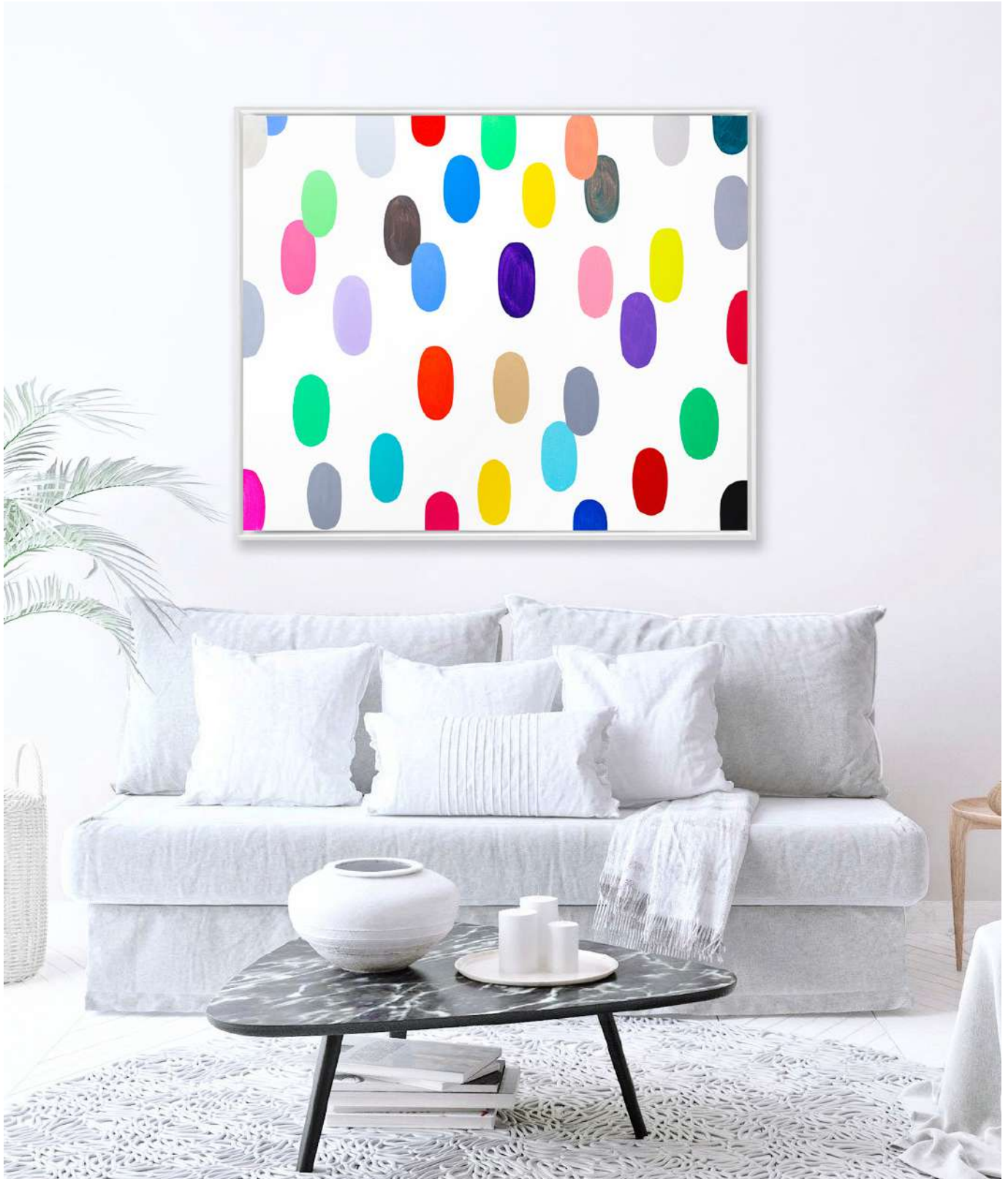
Jelly Bean #92, 2022 acrylic on canvas 36" x 48" (91.4 x 122 cm)