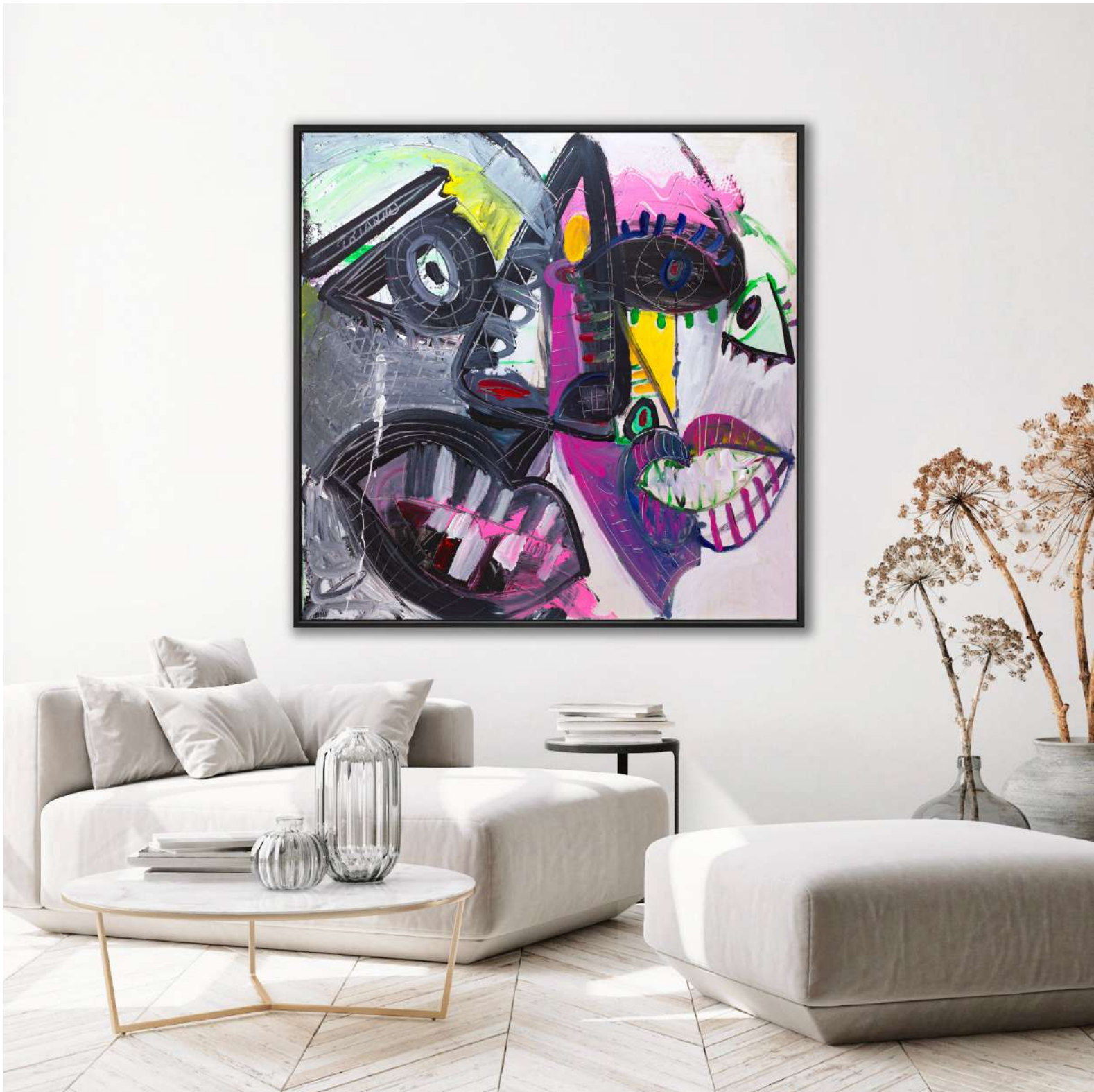
Untitled #5, 2022 acrylic on canvas 48" x 48" (122 x 122 cm)