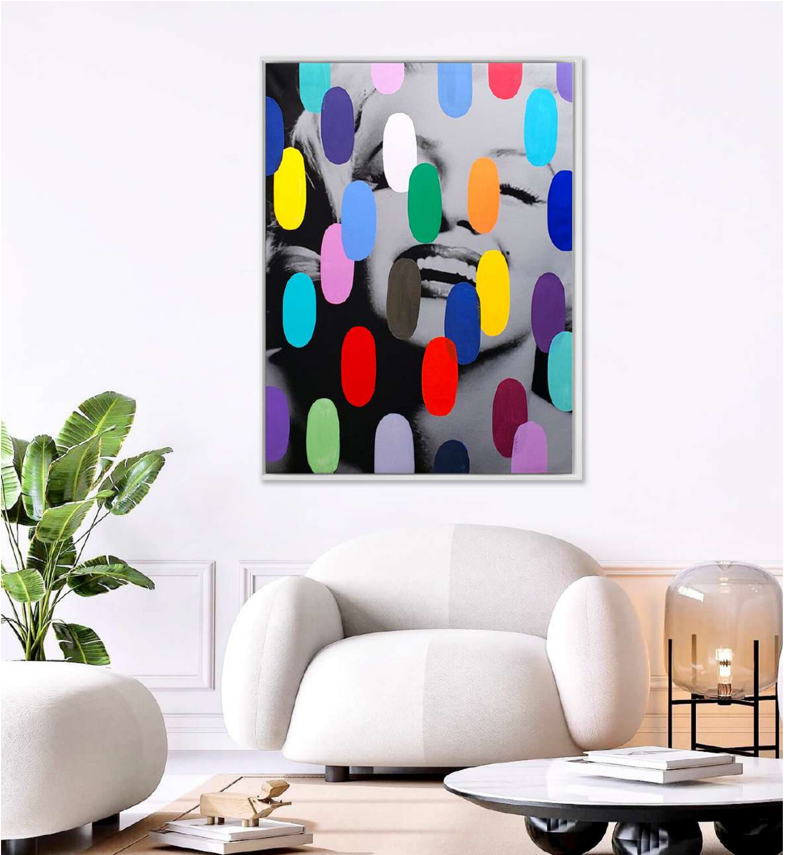
Marilyn Jelly Bean #3, 2022 mixed media on canvas 48" x 36" (122 x 91.4 cm)