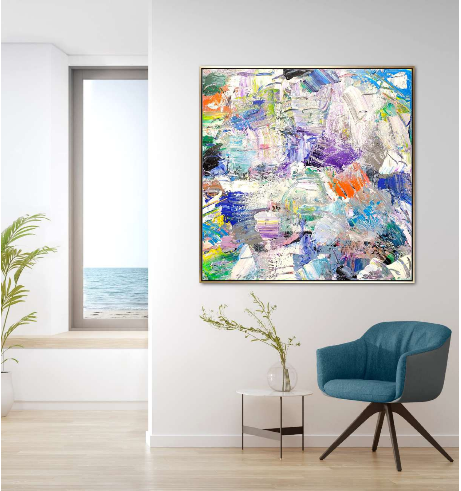
Untitled #53, 2019 acrylic on canvas 48" x 48" (122 x 122 cm)