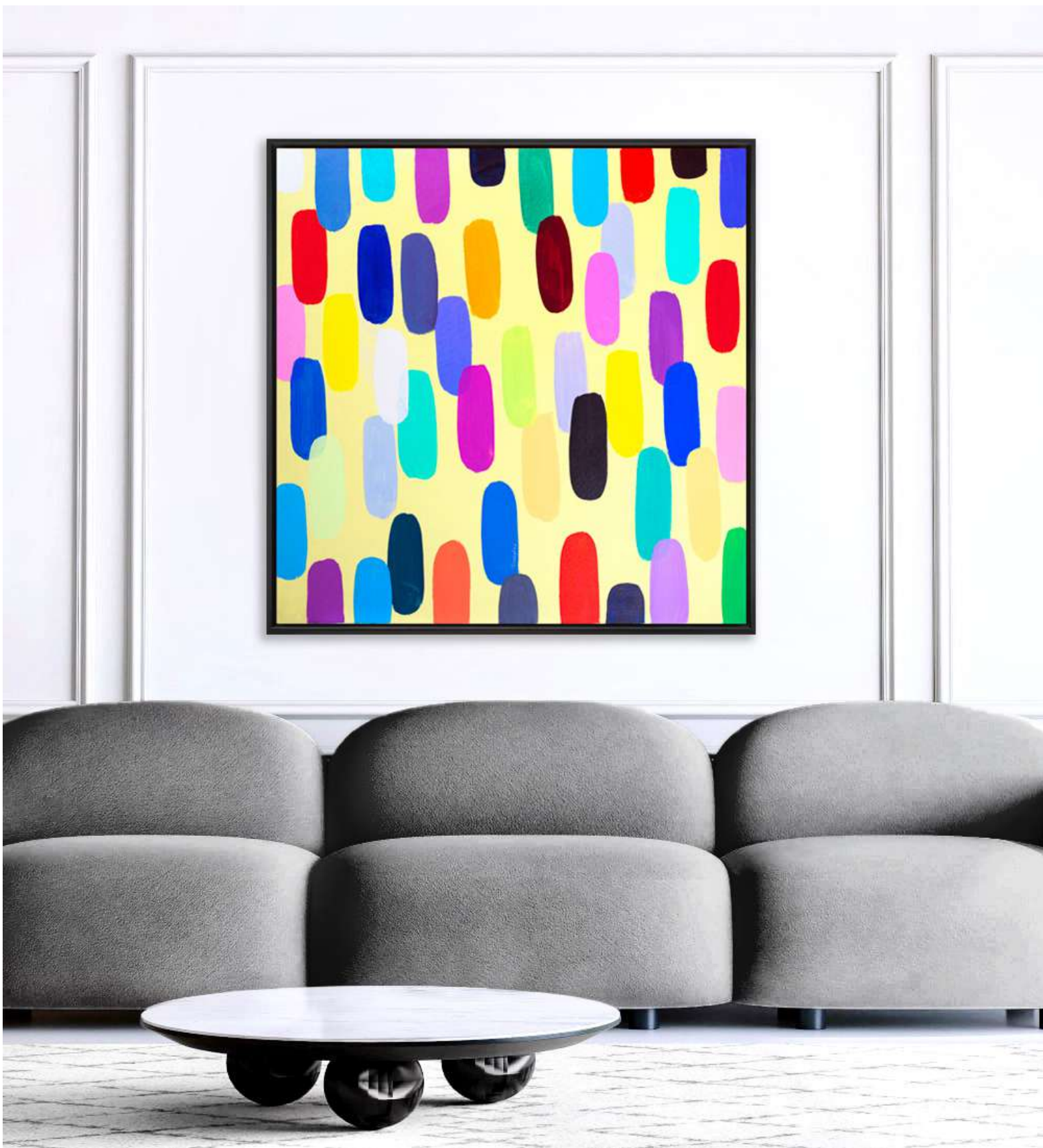
Jelly Bean #63, 2018 acrylic on canvas 48" x 48" (122 x 122 cm)