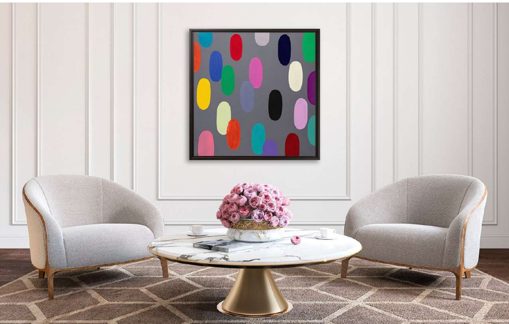
Jelly Bean #82, 2022 mixed media on canvas 36" x 36" (91.4 x 91.4 cm)

Describing 'Jelly Bean' series as an international sensation is an understatement. Having become Peter's ultimate signature series since the beginning of his career, 'Jelly Bean' series is a visual feast of positive energy and joy. Vibrant colours and bold brushstrokes are married together to create lively compositions that are simple yet sophisticated. The adorable colours create a cheerful atmosphere for ANY given spaces providing a positive energy that is utterly alluring.